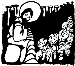
Jesús enseñó con autoridad