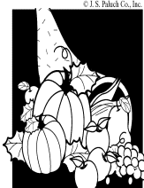
Día de Acción de Gracias

Hagamos de esta celebración, una bonita fiesta para todos, y como nuestra madre se lo merece.